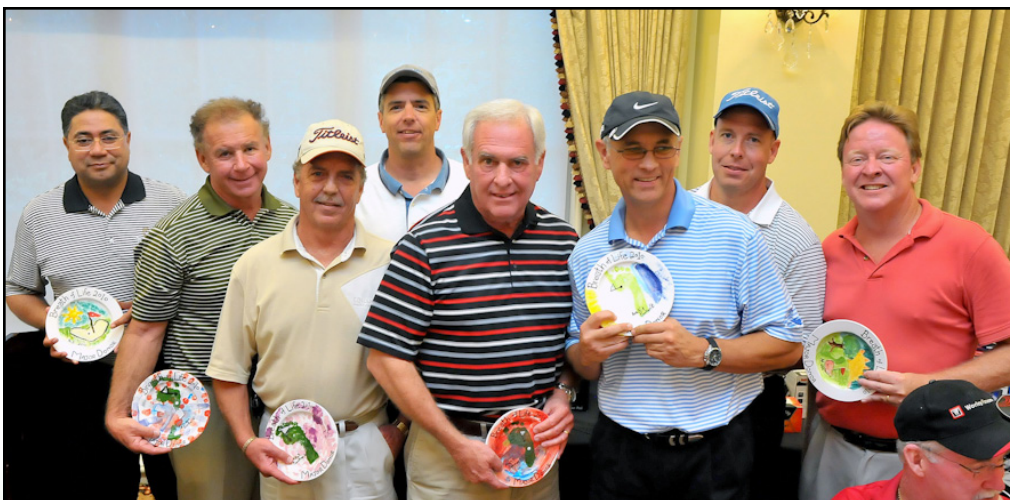
Major Donors show off their plates that are painted by children with Cystic Fibrosis as a token of appreciation. Each plate is initialed by the artist on the back side.