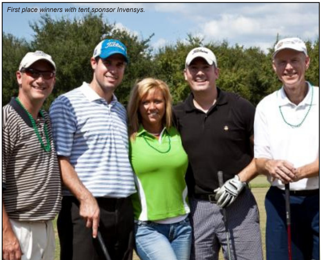
First place winners with tent sponsor Invensys.