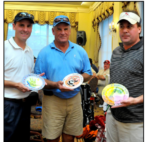
Executive Patron Donors display decorated plates, made by children with CF as a token of thanks.